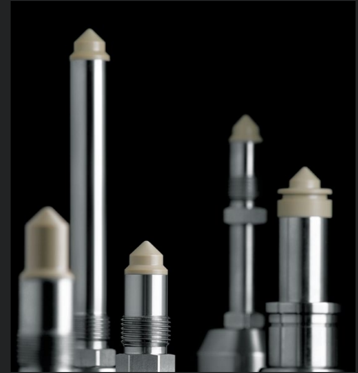
CAPACITIVE LEVEL SWITCHES