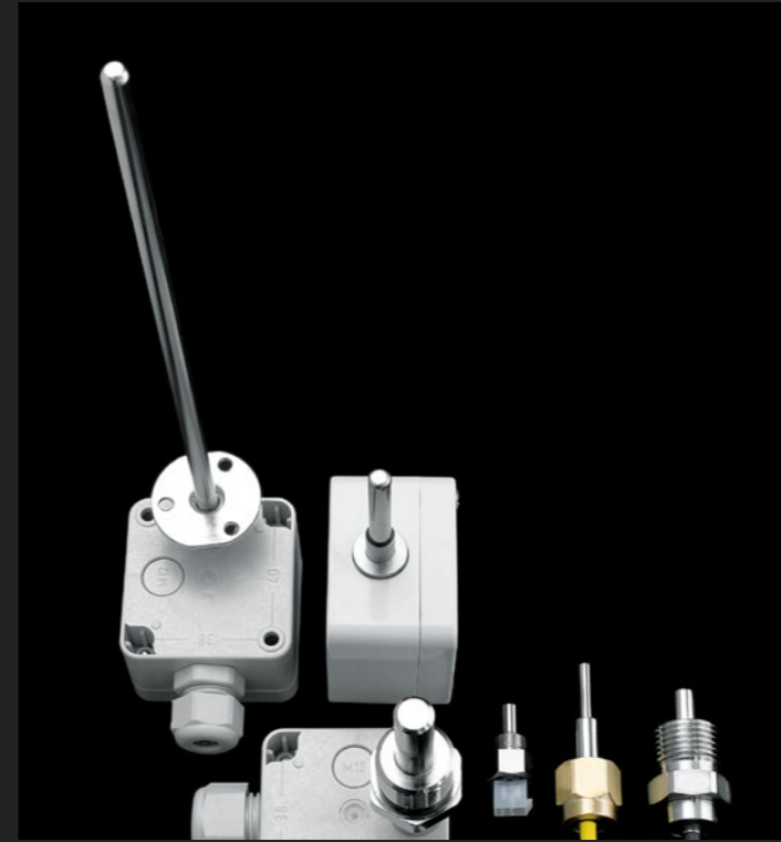
DOMESTIC ENGINEERING AND EQUIPMENT TECHNOLOGY