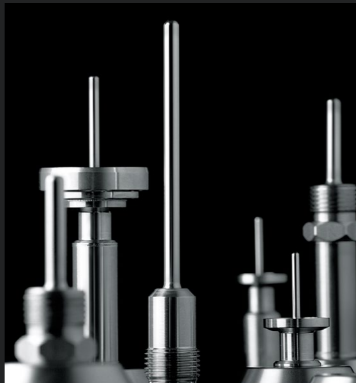
TEMPERATURE SENSORS WITH MOUNTING SYSTEM