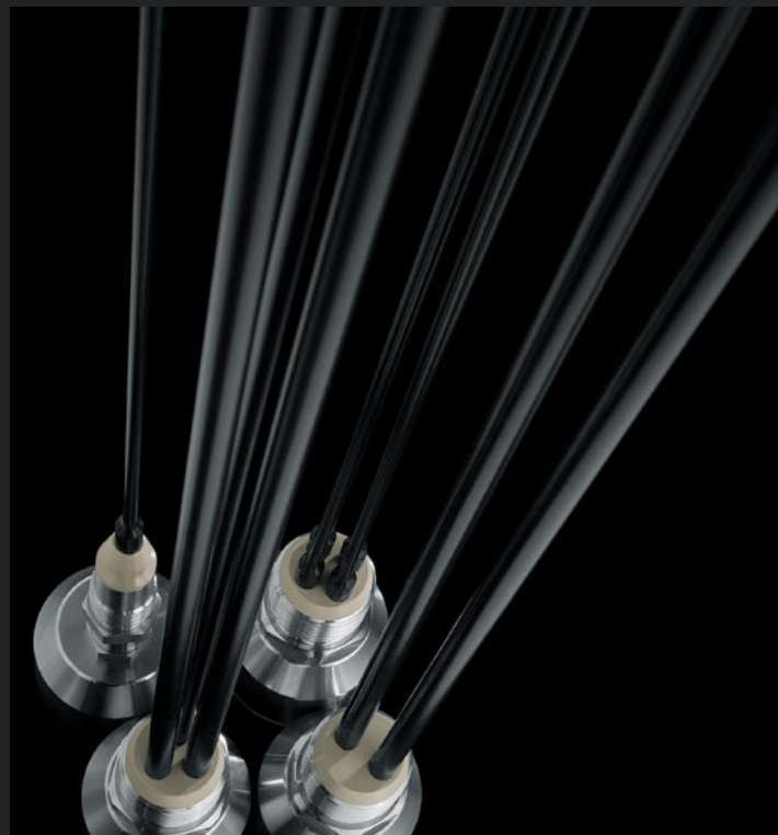
CONDUCTIVE LEVEL SENSORS