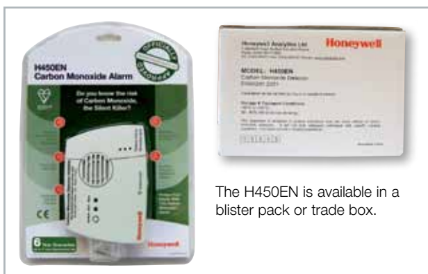
The H450EN is available in a blister pack or trade box.