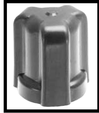
Switch Boot P/N 79380 for Vacuum and Pressure

Type: Direct action blade contact Contacts: Silver alloy, gold plated Set Point: Factory set from 0.5 to 150 PSI Operating Pressure: 150 PSI for 0.5-24 PSI set point range, 250 PSI for 25-150 PSI set point range Proof Pressure: 500 PSI Burst Pressure: 750 PSI for 0.5-24 PSI set point range, 1250 PSI for 25-150 PSI set point range.