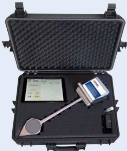
Equipment Case for safe transport of FL-MOBIMIC Profi Check and accessories