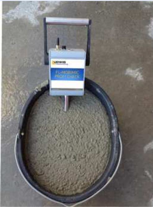
Application of FL-MOBIMIC- ProfiCheck