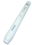
e 2 sense

The Z10 LPG boat alarms with remote sensors are designed to give an early warning of LPG leaks on boats and come in single or dual sensor versions, which can operate from a 12-24V DC power supply.