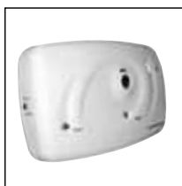
Hard wired Carbon Monoxide Alarms