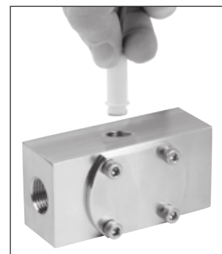
Field Replacement of Sensor