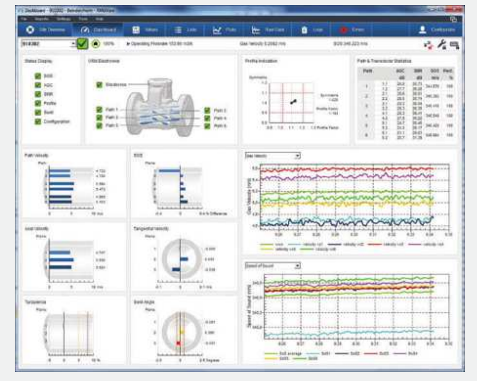
RMGView<sup>USM</sup> facilitates real-time performance monitoring of CBM parameters

First, RMGView<sup>USM</sup> monitors the health of the GT400 and warns if there are any pending problems (e.g. transducer failure). Secondly, it monitors the gas process and alerts when there are any upset conditions (e.g. pipeline contamination, blockages or liquids in the gas stream). Thirdly, the software monitors calculated metering uncertainties and provides alarm notification.